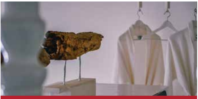
Superior Room (04 units)