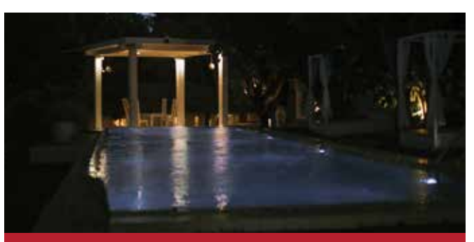
Night Time View